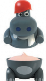
HIPPO STRAWBERRY ICE CREAM