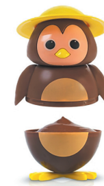
CIP CIOK CHOCOLATE ICE CREAM