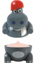
HIPPO STRAWBERRY ICE CREAM